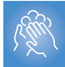
Hand Washing & Sanitizing Locations Readily Available