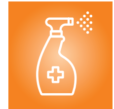
Increased Cleaning of High Touch Surfaces

The safety of our patients and staff is our top priority. In response to COVID-19, we have implemented new protocols and precautions to ensure your safety when you come to Virginia Hospital Center for surgery or a procedure.