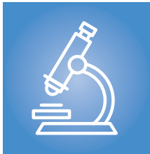
Testing Every Patient for COVID-19 Before Surgery