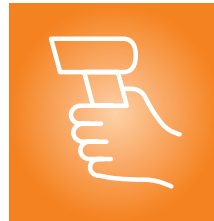
Staff & Patient Symptom Screenings