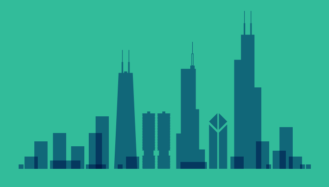
more than the population of the city of Chicago

The estimated number of flu hospitalizations prevented during the 2013-2014 season: